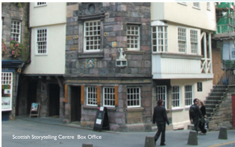
Scottish Storytelling Centre Box Office