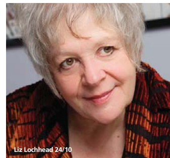
Liz Lochhead 24/10