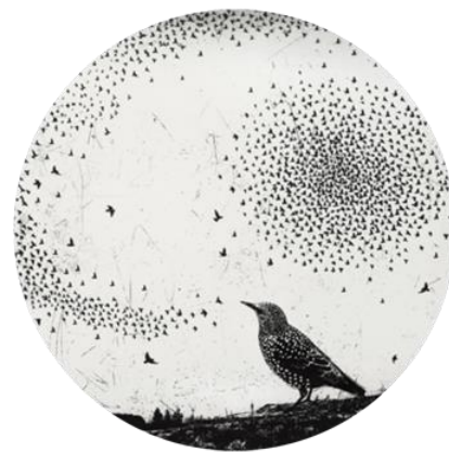
"And Then Songs Filled the Air"